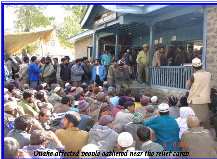
Quake affected people aathered near the relief camp

To remove and prevent their hunger, thirst and cold, we found that there were many NGOs at national and international level, who have provided lot of foodstuff, clothing, blankets and tents etc. but they are direly in need of a reasonably convenient