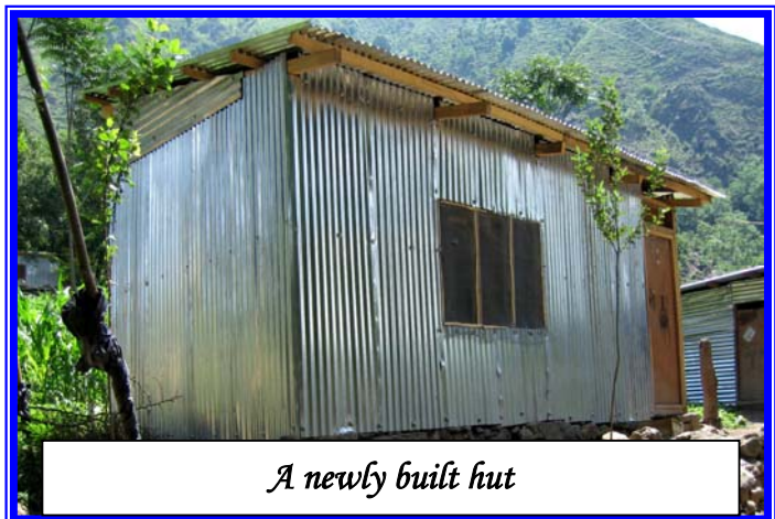
A newly built hut