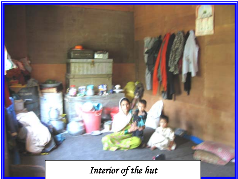
Interior of the hut

One of their many disturbing findings is the low level of morale of women in this village due to sudden loss of their survival resources. Livestock has perished, land are disrupted by the severe impact of quake and considerable loss of lives. Many people are still reeling under the invisible, but palpable psychological stress. However gradually their coming back due to initial stock and survival instruct is slowly returning. Much more need to be done but due to our limitation in manpower and other unfavourable factors the MIMC is hesitant to promise for further assistance.